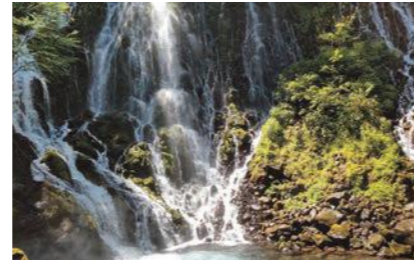
Goshikigahara Forest at the foot of Mt. Norikura